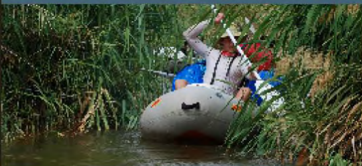
PADDLING ON THE ORANGE