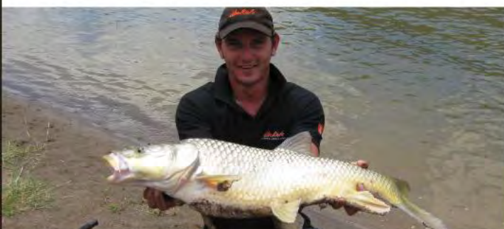
LARGE MOUTH YELLOWFISH