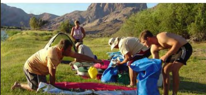
PREPARING CAMP ON THE BANKS OF THE RIVER